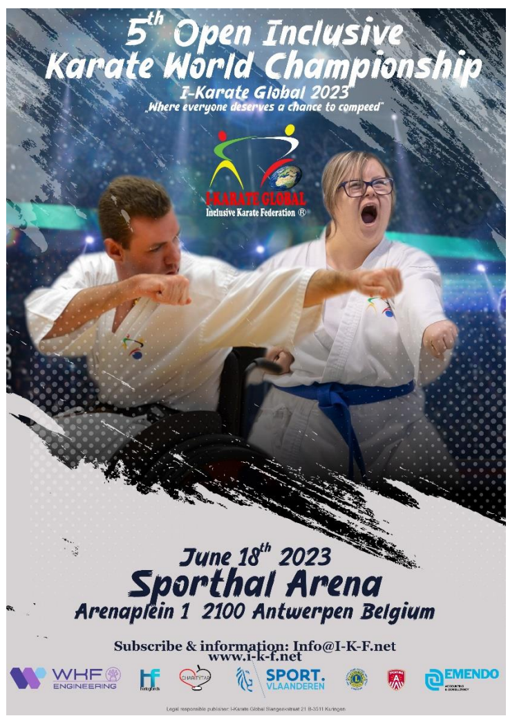
Page 2 of 8

This WC for karateka's with disability will be held on Sunday June 18<sup>th</sup> in the Arenahal, Arenhalplein 1, 2100 Antwerp. We invite everybody to join this unique and special tournament where we can show the world that "karate is for everyone" without any exception. Please support this event and come to visit this great I-karate warriors. You can find all info on <a href="www.i-k-f.net">www.i-k-f.net</a> The tournament is open for all karate styles and organisations and you can join with your student who have a disability.